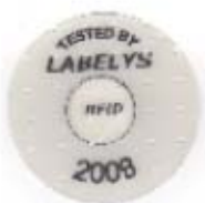
RFID casein label